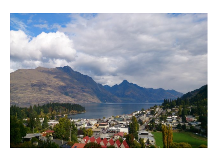
Activities & Recreation